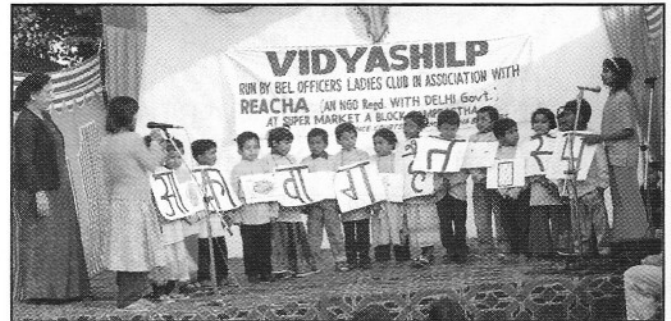
Welcome song on Annual Day Celebrations - 17th February, 2005.

All amenities being provided to the children