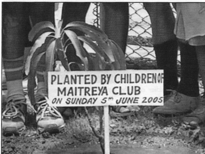
Planting a Sapling.