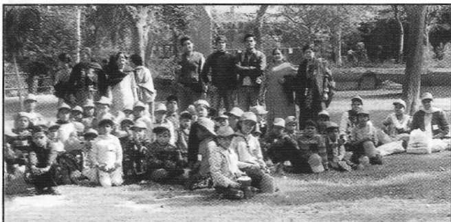
Visit to the Zoo - January 2005.

are free of cost, and the expenses met through financial and material contributions from BOC, BOLC and individual donations. This year the children were taken for a visit to the Zoo. A cultural programme was presented by them as part of Annual Day celebrations. A few children will appear for primary class exams from National open schools.